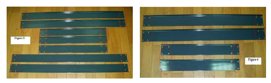
Six Wheel Frame Rails

Step 2. Compare the frame rails to the assembly you received. See Figure 3 or Figure 4.