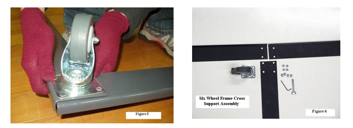
Step 3. Assemble the wheels to the underside of the frame with the bolts and nuts. See figure 5. For the six wheel frame use the cross support to connect the middle of the frame. See Figure 6.